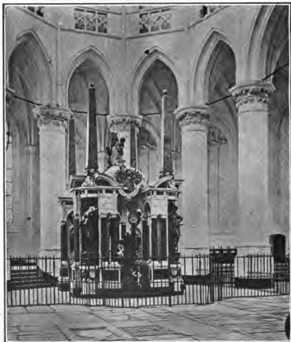
THE TOMB OF WILLIAM OF ORANGE (See Page 98)